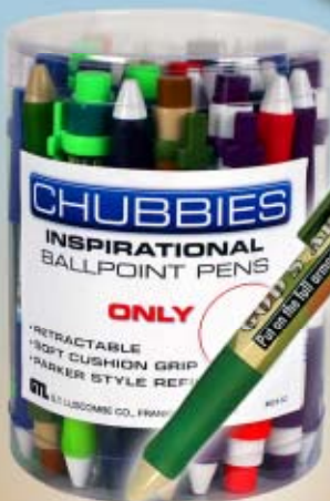
#624-32 CHUBBIES PEN DISPLAY 32 PENS - 9 ASSORTED DESIGNS