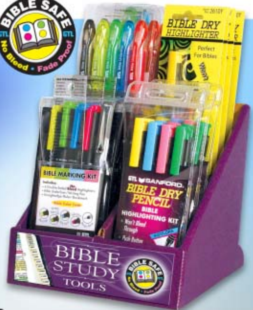
#22470 TOP 4 BEST SELLER IMPULSE DISPLAY INCREASE SALES 3X!!!