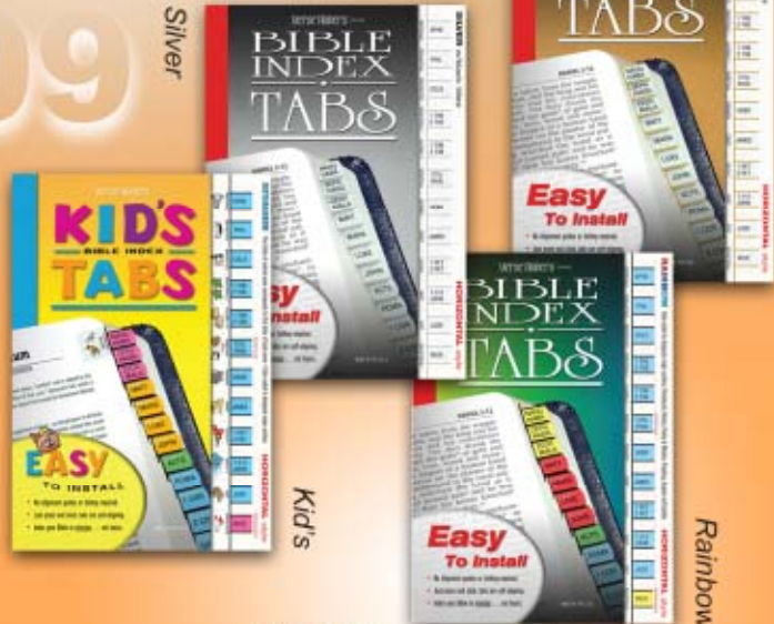
6 EACH: FOUR BEST SELLING HORIZONTAL STYLES